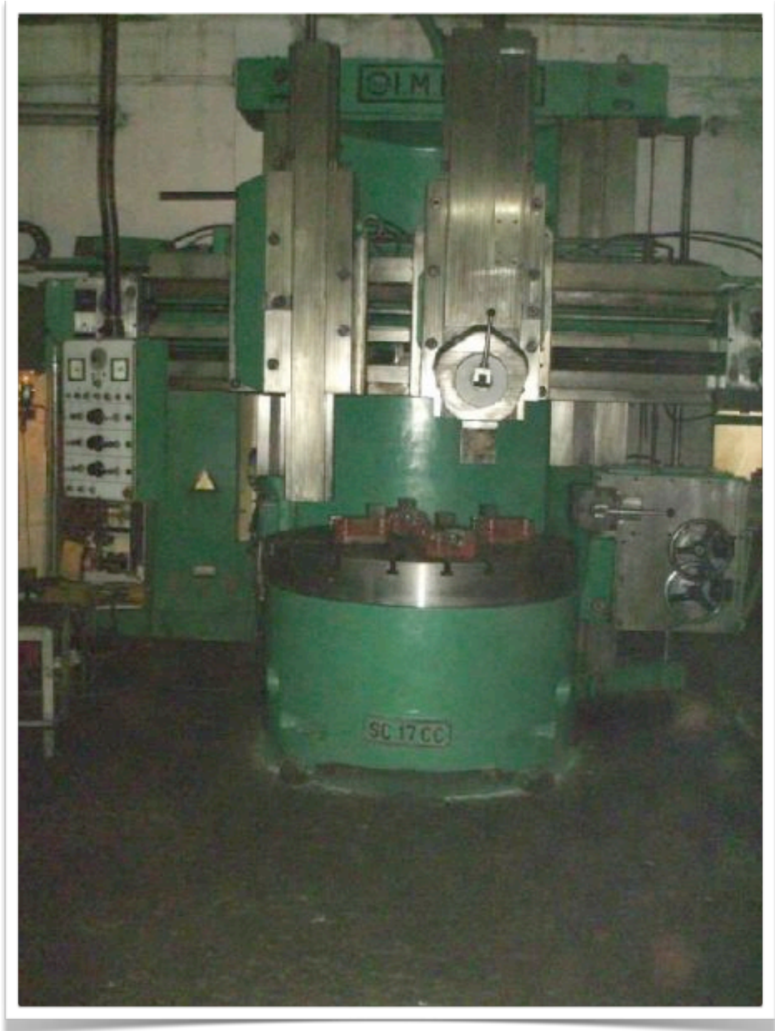
IM ROMAN SINGLE CONSOL KARUSEL LATHE SC 17