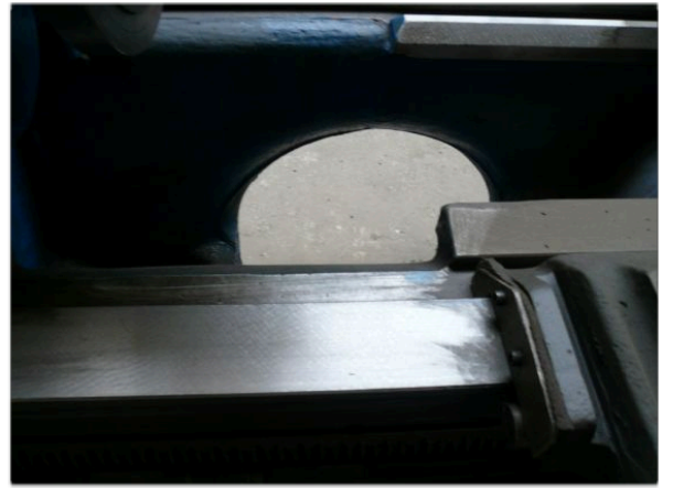
Grinded new surface