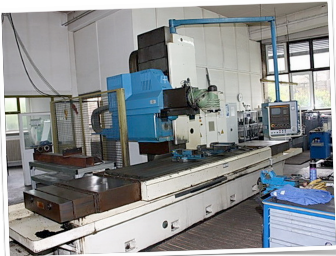
BUTLER TE 300 CNC Vertical Machining Cent.